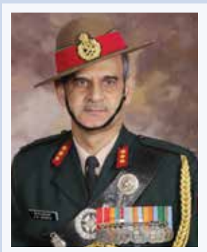
Lt Gen SK Upadhya, AVSM, VSM, SM