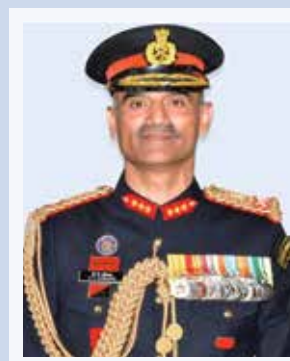
Lt Gen Codanda Poovaiah Cariappa, AVSM, VSM, SM