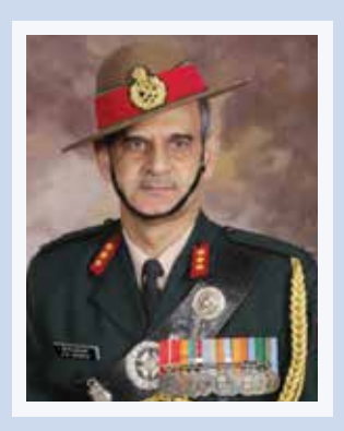
Lt Gen SK Upadhya, AVSM, VSM, SM