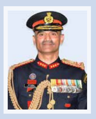
Lt Gen Codanda Poovaiah Cariappa, AVSM, VSM, SM