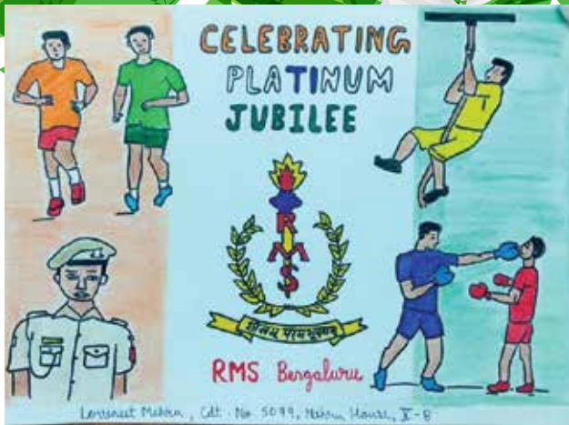
Cdt Lovneet Mehra Class X (5099/NH)